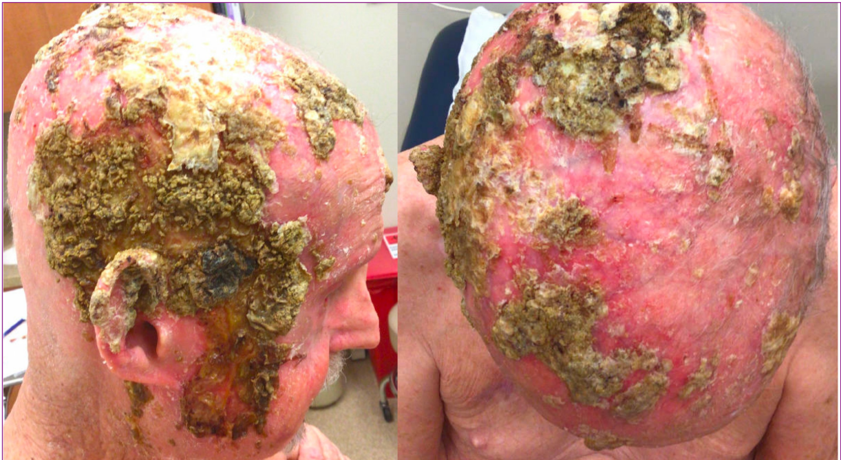
Figure 1. Before first debridement. Large, eroded plaque with overlying yellow-brown crust on the right scalp and temple consistent with EPDS.