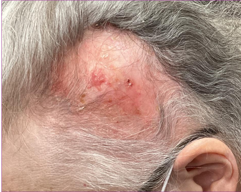
Figure 3. Tumor at 9 months since starting Vismodegib therapy, compared to Figure 2.

BCC and for patients who are not candidates for surgery or radiation therapy. Adverse effects are common and include muscle spasms, fatigue, alopecia, dysgeusia, weight loss, GI upset, diminished appetite, ageusia, arthralgias, and electrolyte disturbances. 3,5 Vismodegib is contraindicated in pregnancy due to its embryotoxic effects. 3 Pulse dosing, a method of drug dosing that provides dose-free periods, can be used to mitigate possible side effects. 6,7