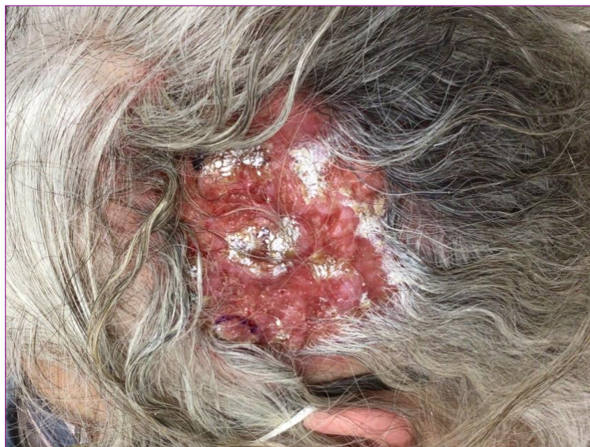
Figure 2. Translucent papules with arborizing telangiectasia on the lateral left scalp measuring 10.8 cm x 9.0 cm.