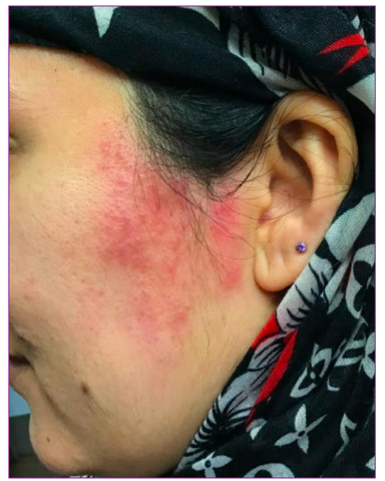
Figure 3. The lesion at 2 months follow-up shows flattening and decreased erythema in the inferior portion which received triamcinolone compared to the superior portion which was not injected at the initial treatment.

plump endothelial cells. B. Infiltrate composed predominantly of small lymphocytes, with admixed histiocytes, numerous eosinophils, and plasma cells