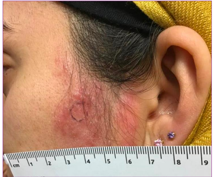
Figure 1. A 4 cm x 5 cm edematous plaque on left pre-auricular area prior to punch biopsy.