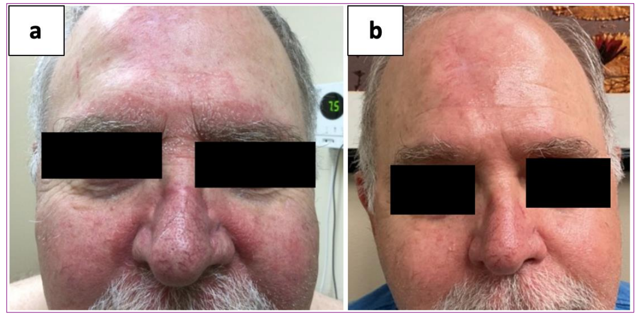
Figure 1. 69-year-old white male with SD before (a) and after (b) treatment with topical roflumilast 0.3%.