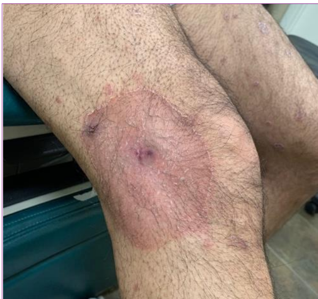
Figure 2- Site of Abrasion from MVA. Lesion with Peripheral Scale Expanded after Application of Triple Antibiotic Ointment.